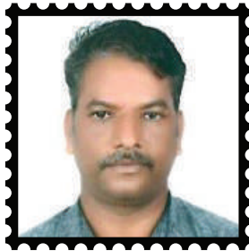
Abdul Nazar Logistics