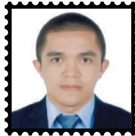
Jester J De Jesus Warehouse