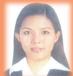
Princess Yuson (Ship Supply)