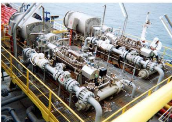
Water Injection Pump Max. 450 m 3 /h