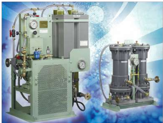
Reverse Osmosis Type Desalination System 1.5 – 250 t/day