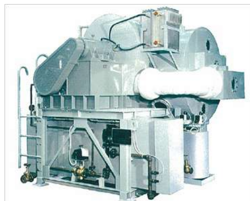
Vacuum Vapor Compression Type Distiller 24 – 480 t/day