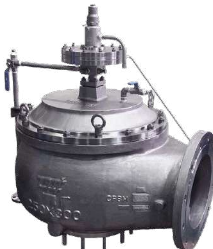
PSL-MD Model (Pilot operated type)

Type approved by various Class Pressure: 1~ 250 kPa Temp: -196 ~ 125 deg.C Size: 2 ~ 14 inch (50~350A)