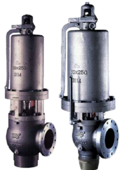
SL Model (Spring loaded type)

ASME V (Sec I) / UV (Sec VIII) approved Type approved by various Class Pressure: ~ 36.8 MPa Temp: ~ 604 deg.C Size: 1 ~ 8 inch (25~200A)