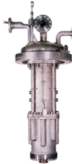
LNG Booster Pump 15 - 1,000 m 3 /h