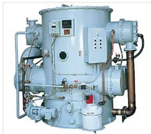
Multi Effect Submerged Tube Type Fresh Water Generator Double Stage: 40 -150 t/day Triple Stage: 100 – 200 t/day