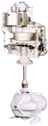
Cargo Pump & Turbine 700 - 6,000 m 3 /h