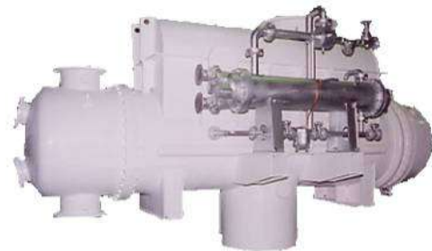
Vacuum Condenser with Steam Ejector unit Max. 1,470 m 3 /h