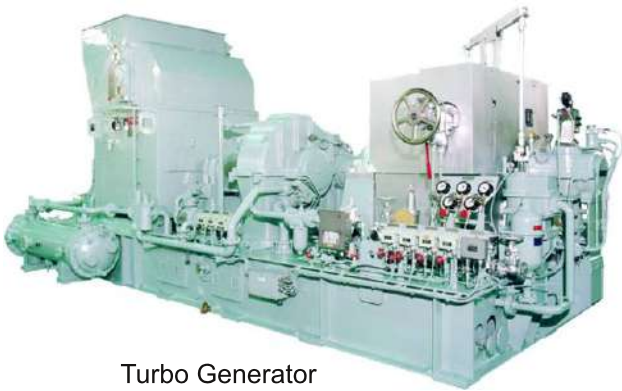
Turbo Generator Max. 20,000 kW