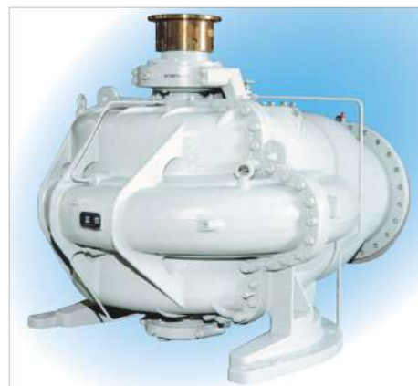
Sea Water Lift Pump