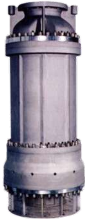
LNG, LPG Cargo Pump 15 - 2,100 m 3 /h