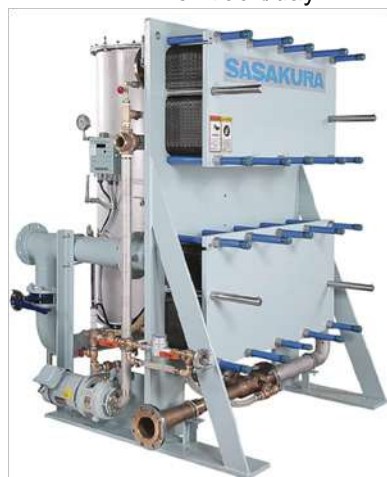
Plate Type Fresh Water Generator Series-EX 5 – 60 t/day