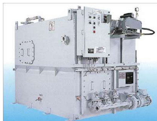
1,920 - 21,000 L/day